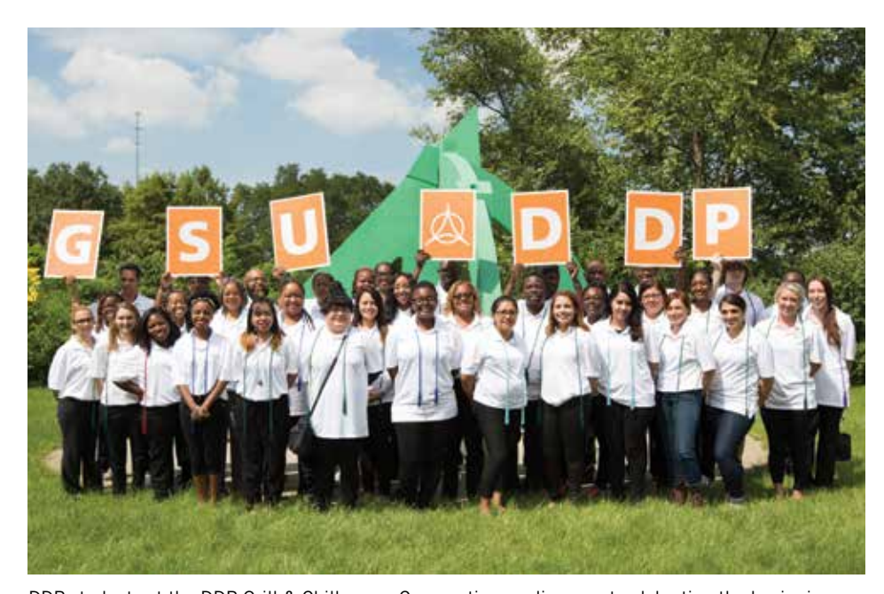
DDP students at the DDP Grill & Chill, a pre-Convocation cording event celebrating the beginning of a new school year and welcoming new GSU-DDP transfer students to GSU. DDP students were presented with a DDP honor cord recognizing the completion of their associate degree from their community college and led the processional of students into the GSU Convocation.

increased 83%, and DDP student enrollment at our partner community colleges at the City Colleges of Chicago increased by 418%, all of which were achievements in our Reaching Vision 2020 Strategic Plan goals and objectives. And DDP growth does not stop there! We are proud to announce that DDP's largest