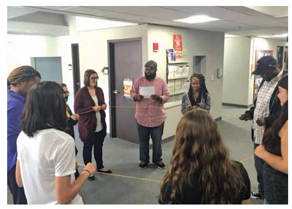
DDP Student Transition Assistants at the STA Orientation Retreat, an opportunity for STAs to learn about various resources and concepts surrounding the topics of communication, diversity and inclusion, team building, leadership, and more.

DDP also entered the Fall 2016 semester with great growth in numbers. Along with having participants at all seventeen community college partner campuses, in the 2015 – 16 academic year overall DDP student enrollment increased 23%, DDP student enrollment at our remote community college partner campuses